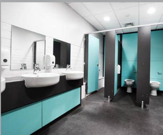
IPS, Cubicles & Vanities