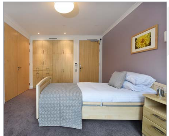
Care Home Bedroom Furniture

We operate from a 120,000 sq ft state of the art purpose built factory located in Springburn, Glasgow. The facility is well equipped with the latest automated machinery combined with a highly skilled flexible workforce operating to BS EN ISO 9001 quality assurance management system. RSBi manufactures a wide range of products and services including: